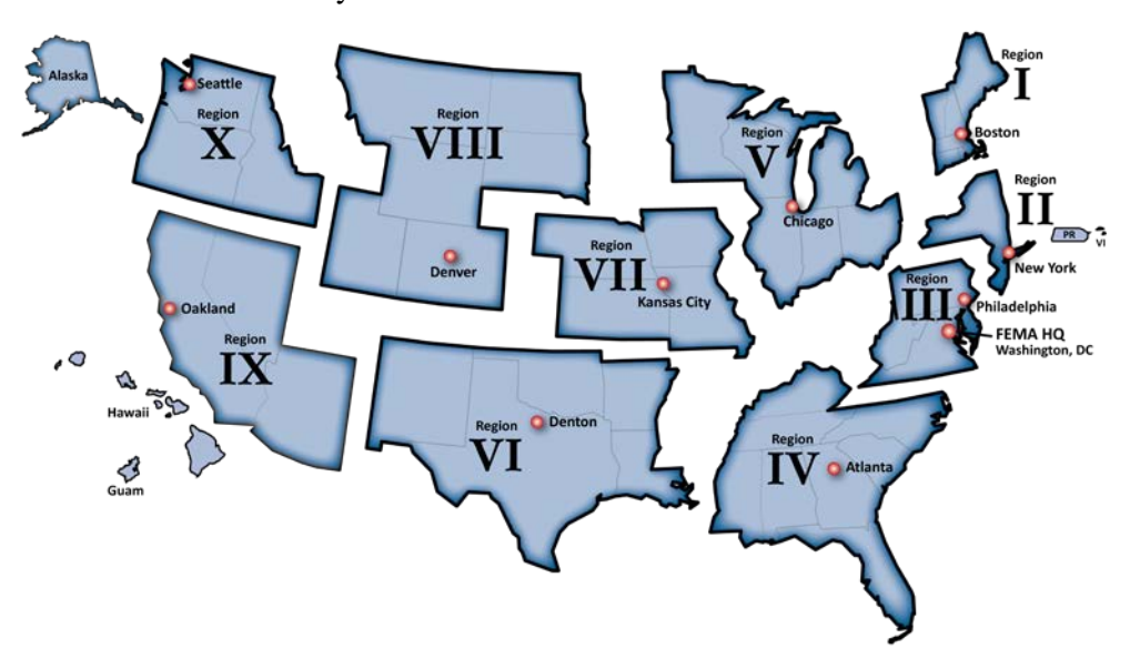
Figure 5: FEMA Regions

staffed by ESFs in anticipation of or immediately following an incident. Operating under the direction of the FEMA Regional Administrator, the staff within the RRCCs coordinates Federal regional response efforts and maintains connectivity with FEMA Headquarters and with state EOCs, state and major urban area fusion centers, Federal Executive Boards, and other Federal and state operations and coordination centers that potentially contribute to the development of situational awareness. The UCG assumes responsibility for coordinating Federal response activities at the incident level once Unified Coordination is established, freeing the RRCC to deal with new incidents should they occur.