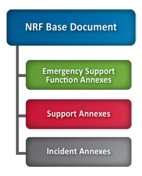
Figure 1: Organization of the NRF